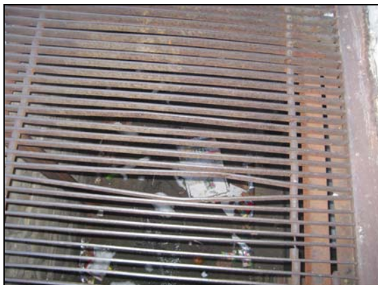
This dangerous metal grating in St. Joe's playground will be replaced before students return in September.

Thanks to financial support from The Endowment for Inner-City Education and an anonymous donor, St. Joe's will soon replace dangerous metal playground gratings and install school signs.